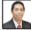
PDG. TEODORO LOCSON COUNCIL ON LEGISLATION DISTRICT REPRESENTATIVE