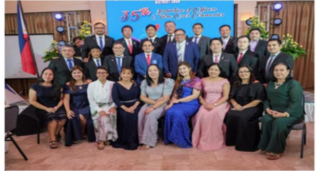
RCCPC BOD 2019-2020 w/ Spouses