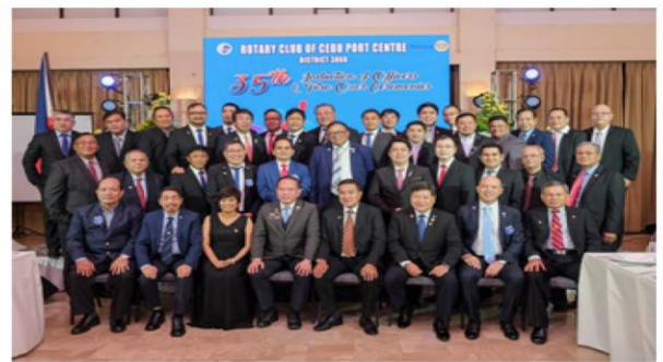
RCCPC with D3860 Officers