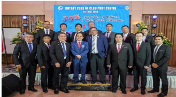
RCCPC BOD 2019-2020