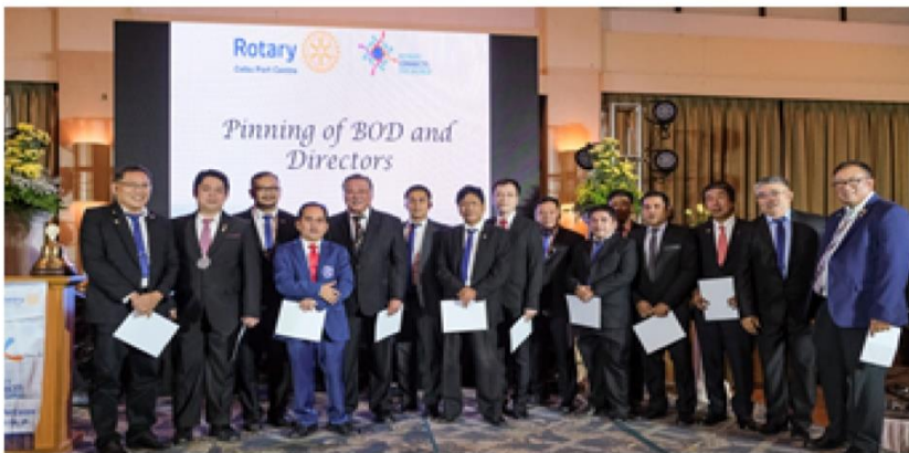
RCCPC Officers Board of Directors RY 2019-2020