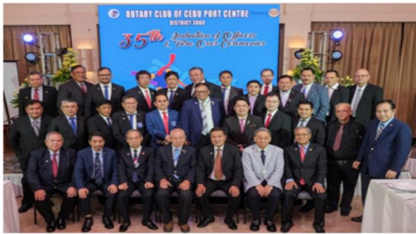
RCCPC with Japan Sister Club