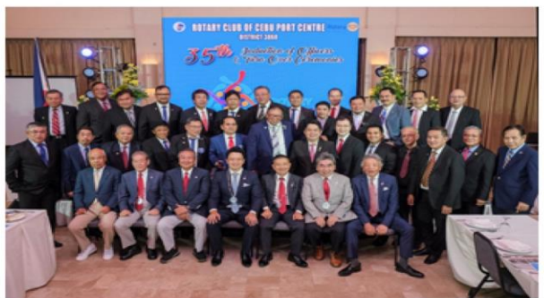
RCCPC with Japan Sister Clubs